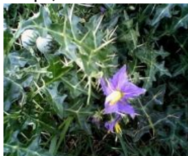
kantakari / kateli