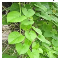
Galo / batindu

kalimirch (Black pepper) 10 gm, jeera (cumin) 10gm, dhaniya (coriander seeds) 20 gm, fenugreek (methi) 20 gm, ajwain (Trachyspermum ammi) 10 gm, adrak (ginger) 50 gm, Haldi (turmeric) 50 gm (fresh), gheekumari (Aloe vera) 100 gm, galo / batindu (Tinospora cordifolia) stem and leaves 100 gm, Lahsun (garlic) 50 gm, lallmirch ( red pepper /chillies) 50 gm, Paan (betel leaves) 10 number, Kari patta (curry leaf) 100 gm, Tulsi leaves 50 gm, tarwar leaves and flowers (Cassia auriculata) 100gm, Nariyal (coconut)100 gm, gud(jaggery) 100gm, rock salt 50 gm, khaneka soda (sodium bicarbonate) 100 gm.